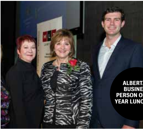
ALBERTA'S BUSINESS PERSON OF THE YEAR LUNCHEON