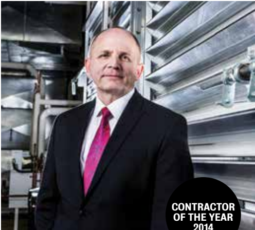
CONTRACTOR OF THE YEAR 2014