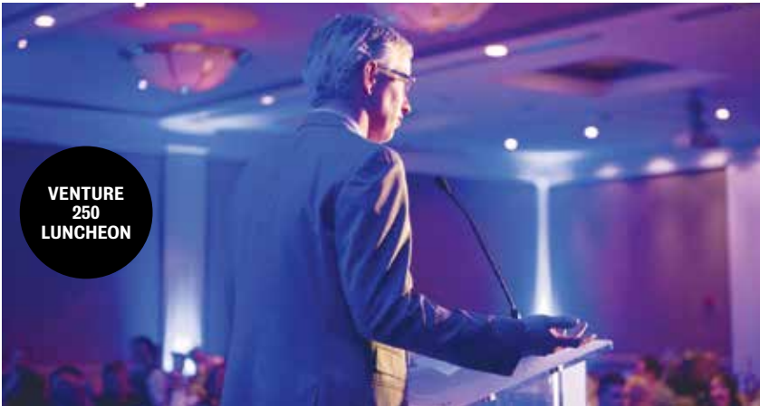
VENTURE 250 LUNCHEON